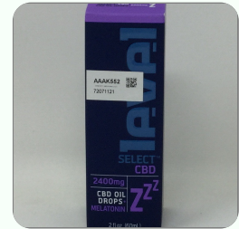
The photos on this report are of a sample collected by the lab and may vary from the final packaging.